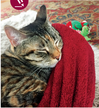
Riley, curled up on Nicole's feet, providing comfort and connection during the pandemic.