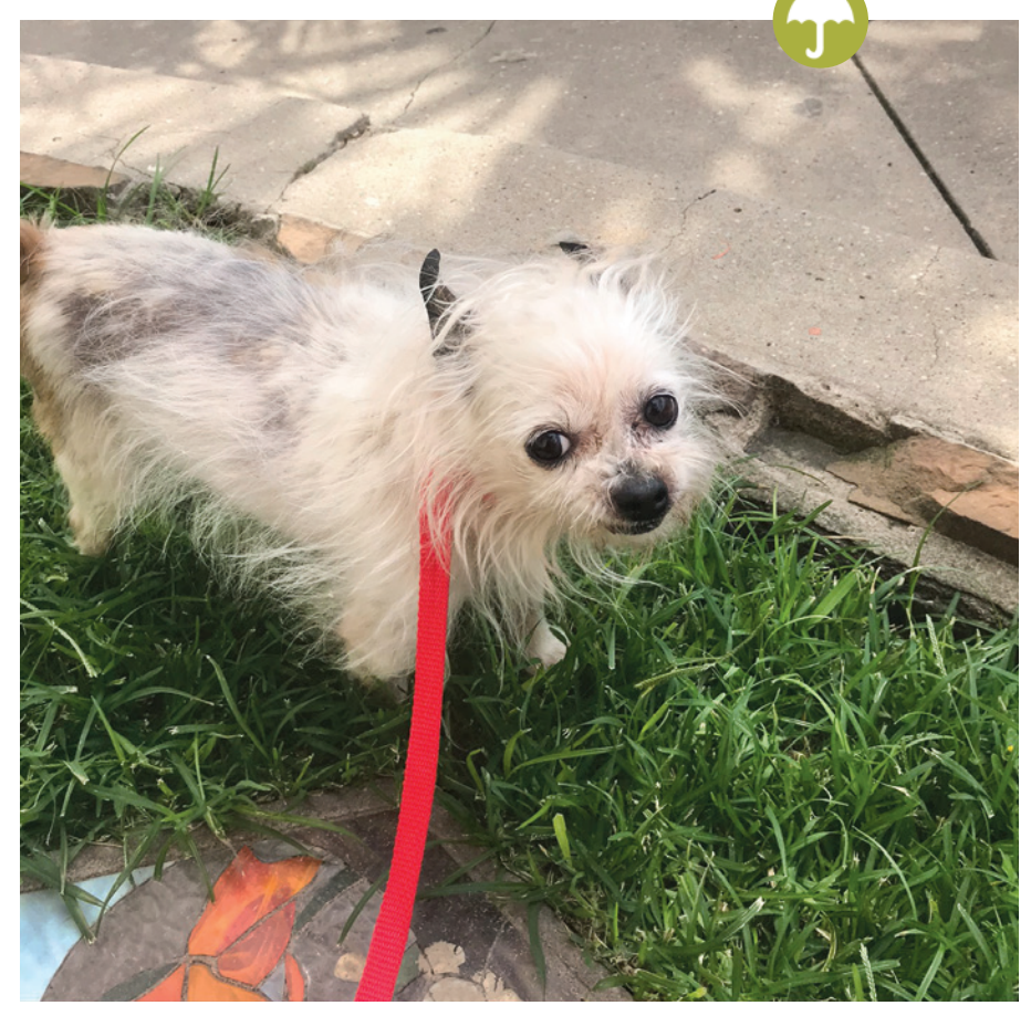
Magic (who is camera-shy) and Heffalump are now safe and sound, thanks to you.

*Names have been changed to protect privacy.