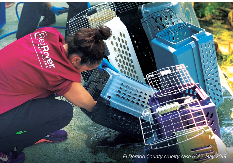
El Dorado County cruelty case (CA), May 2019

♥ VOLUNTEER | Tulsa floods (OK), July 2019