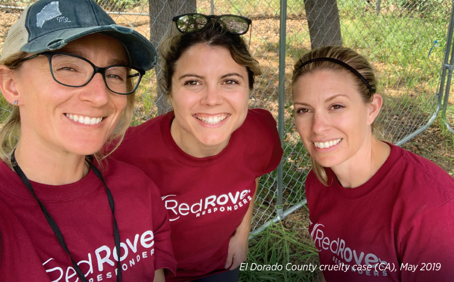
El Dorado County cruelty case (CA), May 2019

"I loved getting to see owners come visit their animals. Watching a pet that I have been slowly trying to work with bound with joy at seeing their people made my heart sing."