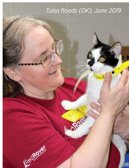
Tulsa floods (OK), June 2019

♥ VOLUNTEER Leon County domestic violence shelter pet housing build (FL), April 2019