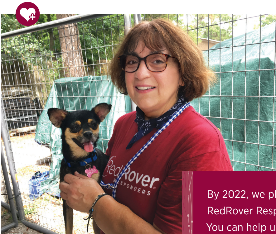
Leon County domestic violence shelter pet housing build (FL), April 2019

Follow us on Facebook for more updates: Facebook.com/RedRover.org .