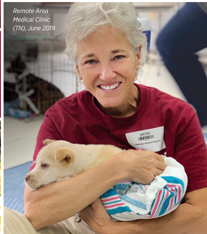
Remote Area Medical Clinic (TN), June 2019

♥ VOLUNTEER Remote Area Medical Clinic (TN), June 2019